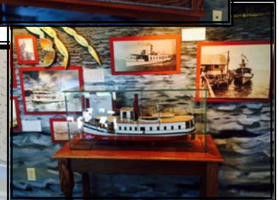
Exhibit In Full Swing!

Seven models of authentic bay-boats that served Fairhope for some time during the period 1894 to 1933 are now on display in the main exhibit hall of the Museum. On June 12, Mayor Kant cut the ribbon to officially open of the newly created exhibit of bay-boats that served the Eastern Shore, with emphasis on