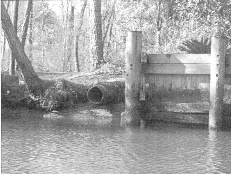
City of Fairhope storm drain pipe into Fly Creek: December 2013