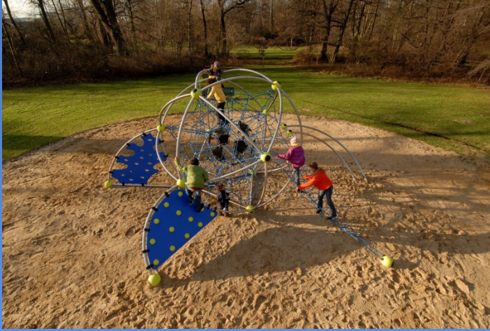
CUSTOM ROUND-5 MODULAR PLAYSYSTEM Back Perspective