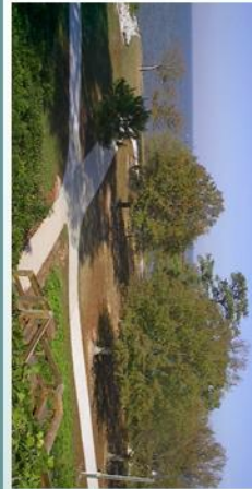
South Beach Park Loop Trail

*This brochure compiled by The Fairhope Environmental Advisory Board With support from the Fairhope Single Tax Corp and the City of Fairhope Planning & Building Dept.