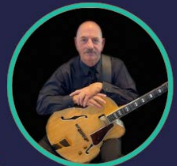
Jazz Guitarist, Bill Coleman