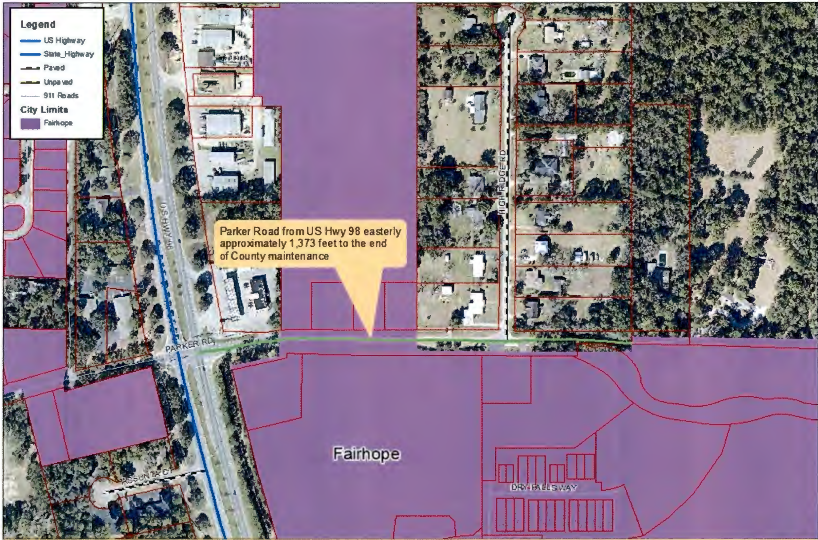
Exhibit A Transfer of Maintenance Agreement