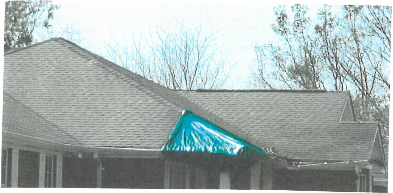
Localized roof damage- may repair just area impacted