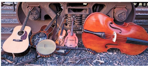
The Blue Mullet

Bluegrass band will be in concert here at the James P Nix Center on Thursday December 13 at 2:00 playing great bluegrass standards and holiday favorites. This event is free and open to the public.