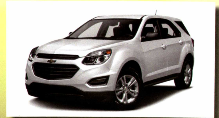
2018 Chevrolet Equinox