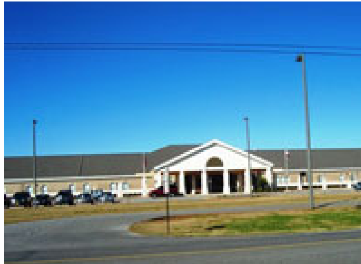
Daphne East Elementary 26651 County Road 13 Daphne, Alabama 26526