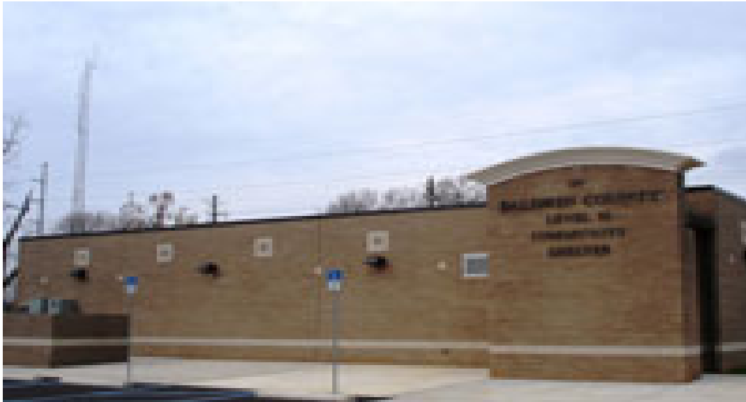
Baldwin County Level II Community Shelter 207 North White Avenue Bay Minette, AL 36507