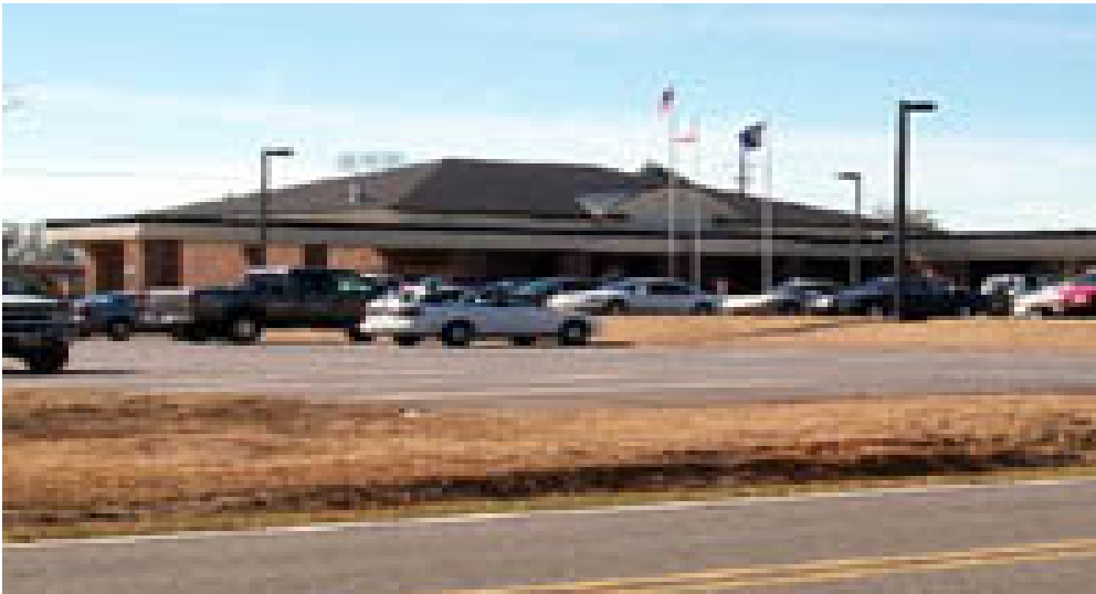
Foley Satellite Courthouse 201 East Section Avenue Foley, AL 36535