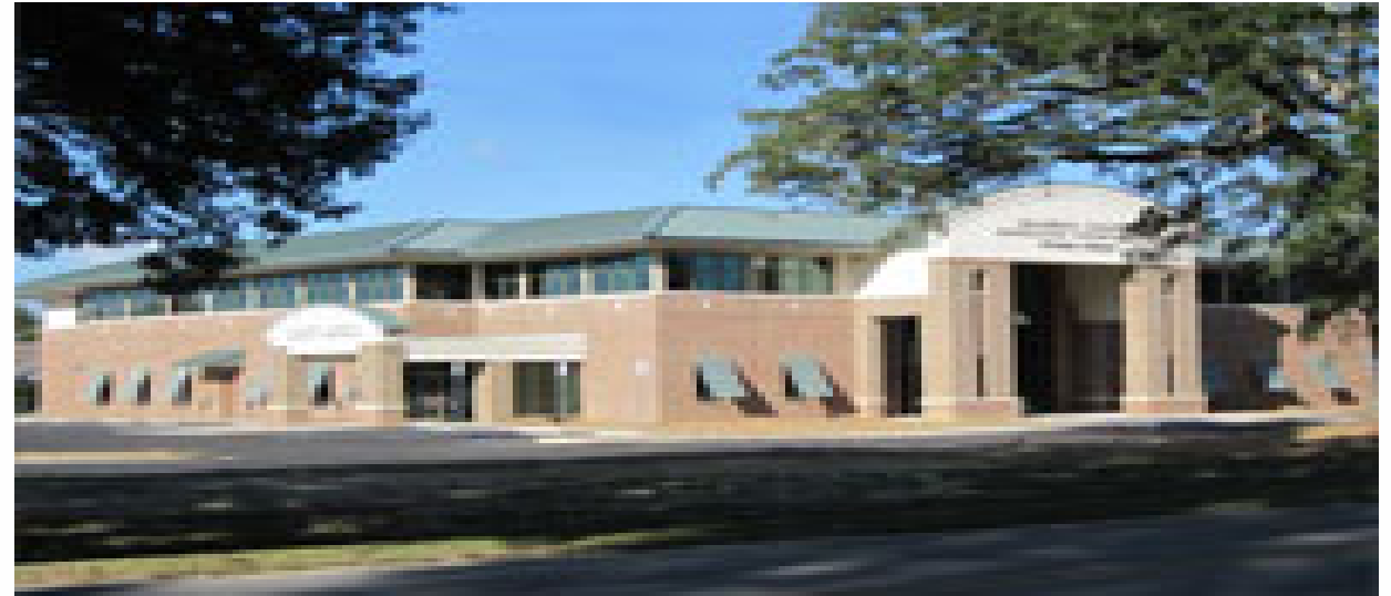
Fairhope Satellite Courthouse 1100 Fairhope Avenue Fairhope, AL 36532