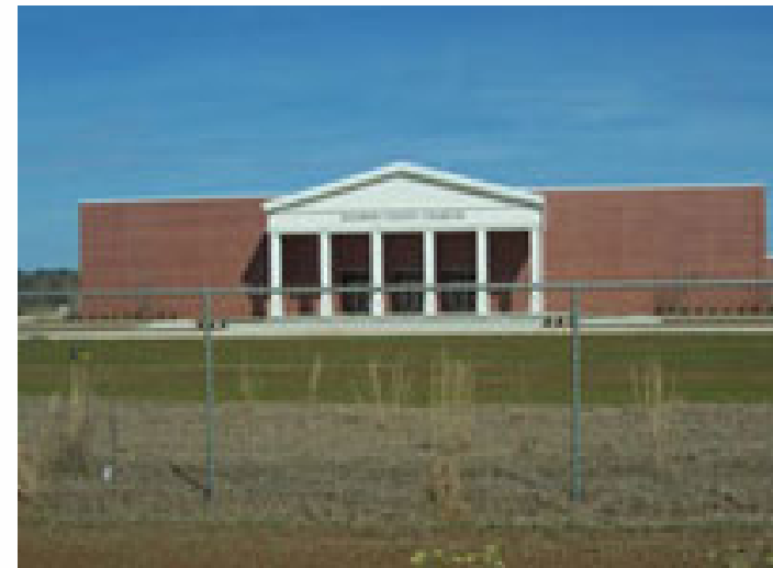
Baldwin County Coliseum 19477 Fairground Road Robertsdale, Alabama 36567