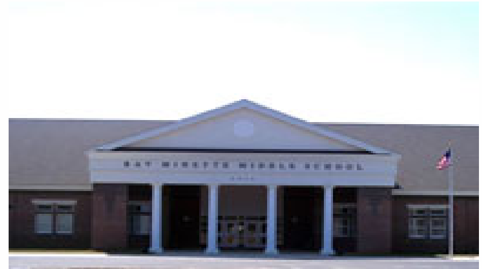
Bay Minette Middle School 1311 West 13th Street Bay Minette, AL 36507