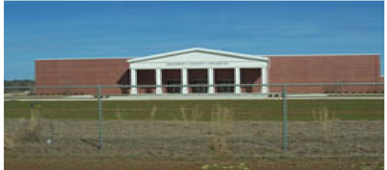
Baldwin County Coliseum 19477 Fairground Road Robertsdale, AL 36567