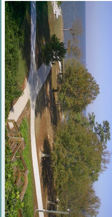
South Beach Park Loop Trail

*This brochure compiled by: The Fairhope Environmental Advisory Board With support from the Fairhope Single Tax Corp. and the City of Fairhope Planning & Building Dept.