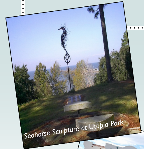
Seahorse Sculpture at Utopia Park